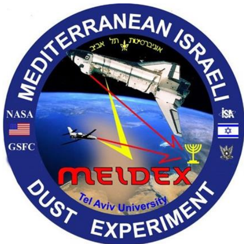
MEIDEX emblem 11