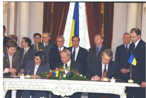
Signing ceremony of a space agreement cooperation between Israel and Ukraine, 2000.